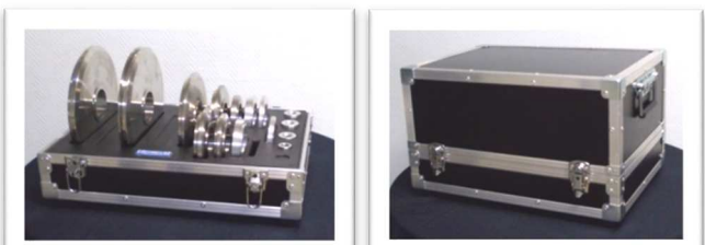
Suitcase for post planning and transportation

(OP0101) : 260 x 260 x 310 mm - weight empty : 6 kg