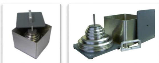
transport metal boxes

(OP0101) : 260 x 260 x 310 mm - weight empty : 6 kg