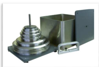
transport metal boxes

(OP0101) : 260 x 260 x 310 mm - weight empty : 6 kg