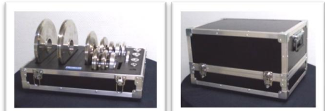
Suitcase for post planning and transportation

(OP0101) : 260 x 260 x 310 mm - weight empty : 6 kg