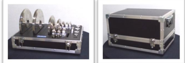
Suitcase for post planning and shipping (OP0095) small : 280 x 250 x 280 mm - weight empty : 5 kg (OP0099) large : 500 x 350 x 280 mm - weight empty : 11 kg