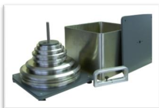
transport metal boxes

(OP0101) : 260 x 260 x 310 mm - weight empty : 6 kg