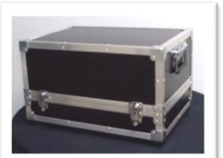
Suitcase for post planning and shipping

(OP0095) small : 280 x 250 x 280 mm - weight empty : 5 kg