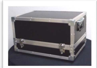
transport metal boxes

(OP0101) : 260 x 260 x 310 mm - weight empty : 6 kg